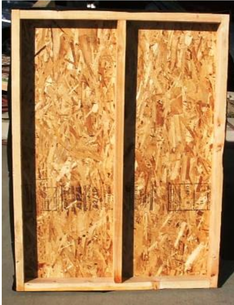
Photograph No.4 Rain Test Results No Water Penetration to the Underside of the Roof Deck.