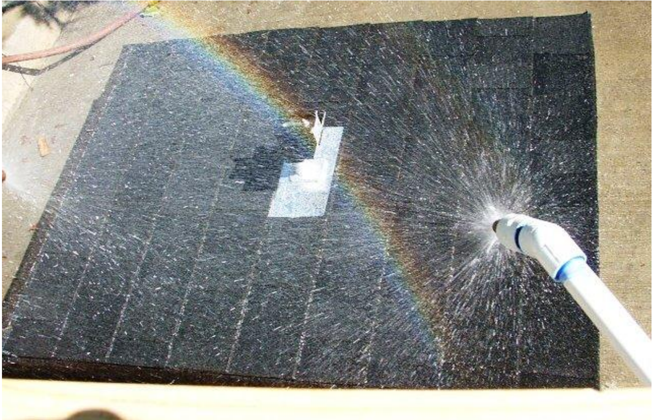
Photograph No.1 Rain Test Set-up No.1