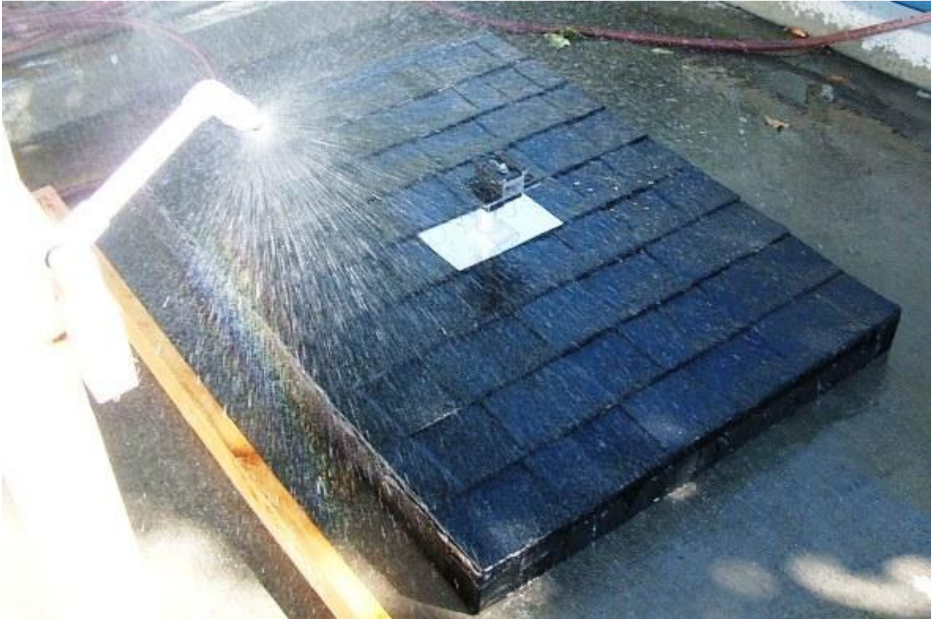
Photograph No.2 Rain Test Set-up No.2