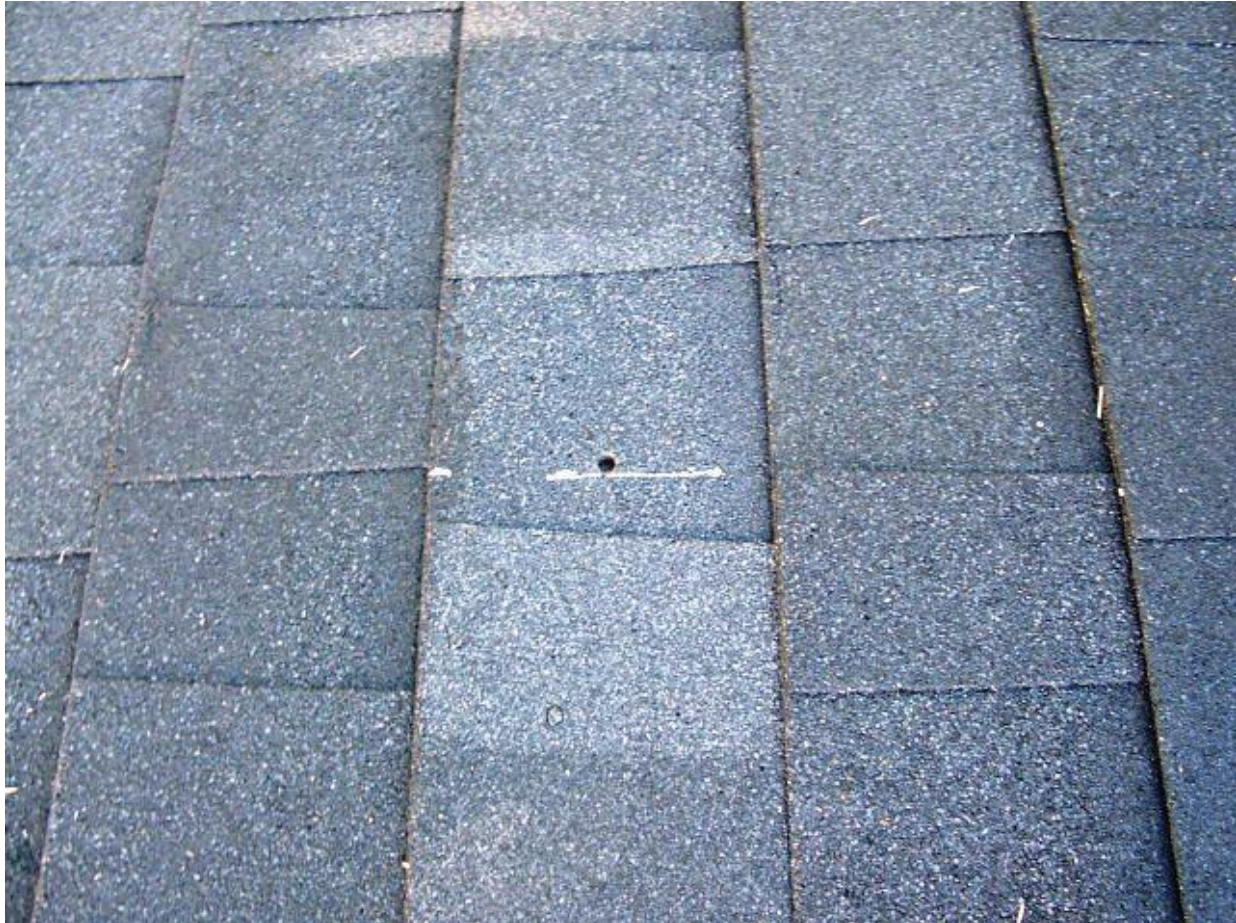
Photograph No.3 Rain Test Results No Water Penetration through or Around Roof Flashing